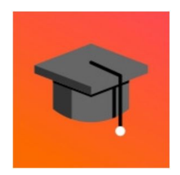
Concepts can be mastered