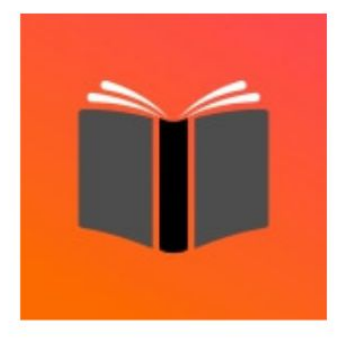
Lectures Are For The Past